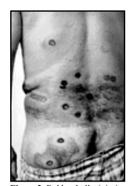
Figure 2: Rubber-bullet injuries induced by MA/RA 88 bullet. In this patient, 13 blunt injuries were detected on the back.

The 201 rubber-bullet injuries were randomly distributed all over the body ... Injuries were mostly located in the limbs (n=73), but those to the head, neck, and face (61), chest (39), back (16) and