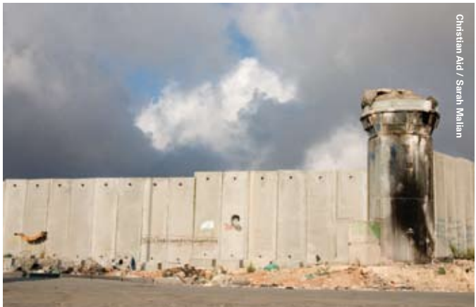
A watchtower in the barrier between Qalandiya and East Jerusalem

The checkpoints, road blocks, permit system and separation barrier all contribute to the violations of the right to freedom of movement, and their continued existence in the Occupied Palestinian Territories undermines viability. As long as Palestinians are prevented from entering East Jerusalem and have no free movement between the West Bank and Gaza Strip, economic and political viability will remain impossible.