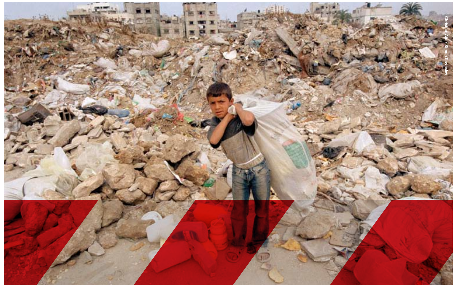
Scavenging for plastic bottles to resell at a rubbish dump in the northern Gaza Strip

Christian Aid believes it is unacceptable that, while the European taxpayer continues to bear the increasing costs of alleviating humanitarian suffering, the EU – the largest donor to the Palestinians and one of Israel’s largest trading partners – maintains a position of limited engagement. It should work to bring the parties together in search of a viable solution, and support its implementation.