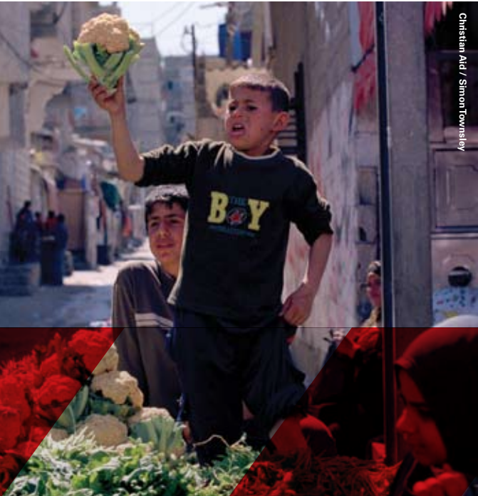
A young boy selling his father's cauliflowers in Gaza City

Failure to address economic viability will perpetuate the Palestinians’ dependency on international aid and continue to undermine its political viability. It will also perpetuate the burden that occupation places on the Israeli economy and its need for US aid.