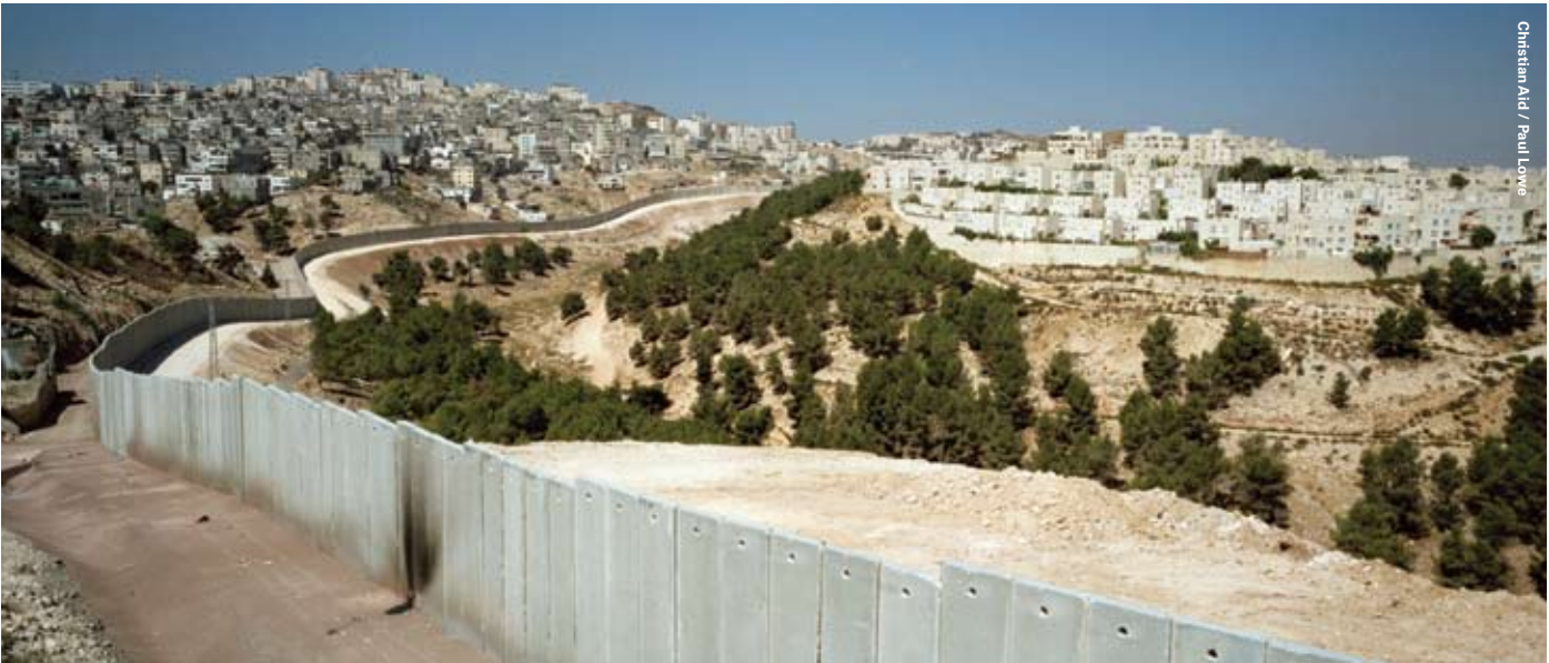
The barrier dividing the refugee camps of Anata and Shu’afat (left) from East Jerusalem, but incorporating the illegal settlement of Pisgat Ze’ev (right) into Jerusalem’s boundaries