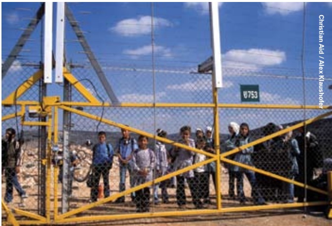
Children in the West Bank wait for the gates in the barrier to be opened so they can get to school

While Israel is a sovereign state and exercises sovereignty, this right must also be afforded to Palestinians. The Palestinians as a people have the right to self-determination and political freedom. This includes the Palestinian refugees. As an integral part of the Palestinian people, it is essential to recognise the status and rights of Palestinian refugees within a viable solution, and their right to participation in the political process.