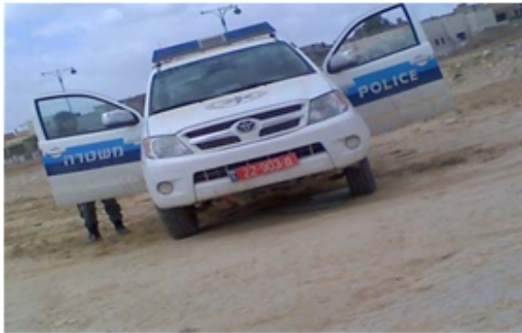
Pictured: Israeli police checkpoint outside the village of Tarabeen al-Sana in the Naqab in 5/09.

A letter sent in 5/09 to the head of the police in the south demanding the immediate dismantling of police blockades and checkpoints set up at the entrances to the Arab Bedouin village of Tarabeen al-Sana ('Amra) in the Naqab. Villagers have also been subjected to random stop and searches.