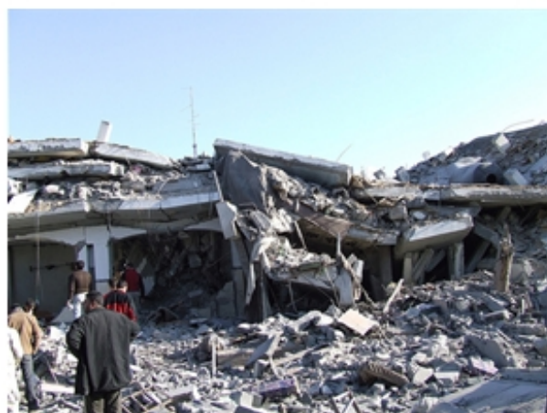
Pictured: Gaza City home entirely destroyed during "Operation Cast Lead" (1/09).

On 27.12.08, the Israeli military launched an offensive against the Gaza Strip which continued until 18.1.09. During this three-week operation (Operation "Cast Lead"), UN and Palestinian NGOs in Gaza report that at least 1,440 Palestinians were