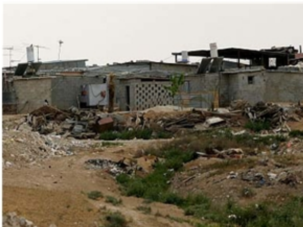
Pictured: A demolished Arab Bedouin home in the unrecognized village of Khisham Zina in the Naqab.

Hearings were held in 1/09 and 2/09 before the Tel Aviv District Court on a petition challenging Tel Aviv University's age restrictions on admission to its medical school that discriminates against Arab students. The case is now proceeding on a civil lawsuit track; next hearing in 12/09.