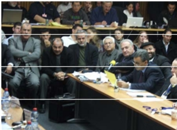
Pictured: Arab MKs and Adalah's General Director at the Central Elections Committee in 1/09.

In the run-up to the elections, right-wing Members of Knesset (MKs) submitted motions to the Central Elections Committee (CEC) in 1/09 to disqualify two Arab political parties - The National Democratic Assembly (NDA)-Balad and the United Arab List-Arab Movement for Change (UAL-AMC) - from running for election. The motions charged violations of section 7A of the Basic Law-The Knesset: that the NDA denies the existence of Israel as a Jewish and democratic state by calling for a "state for all its citizens", and that both the NDA and the UAL-AMC support terror organizations and 'enemy states' against Israel. Adalah represented the parties before the CEC arguing that there is no legal basis to disqualify either. The CEC voted to ban to the Arab parties, supported by the three main political parties - Kadima, the Likud and Labor.