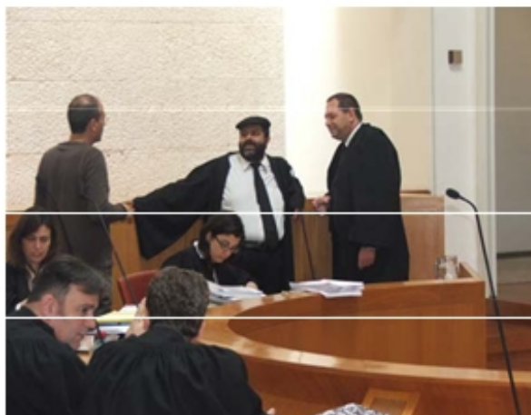
Pictured: At the Israeli Supreme Court before the hearing on the Citizenship Law case in 3/09.

http://www.adalah.org/eng/pressreleases/pr.php?file=09_03_09