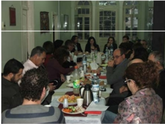
Pictured: Roundtable participants at Adalah, 2/09

In 2/09, Adalah held a roundtable discussion for around 25 Palestinian and Israeli lawyers, academics and human rights professionals from Israel and the OPT to examine the possible means of enforcing international law both in international courts and foreign national courts, in the aftermath of Israel's military attacks on Gaza during December 2008 - January 2009.