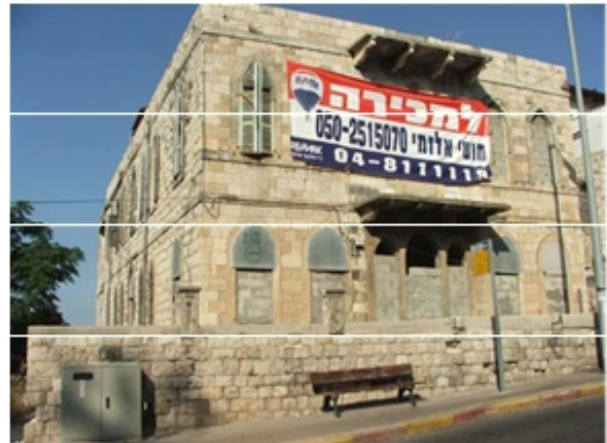
Pictured: Palestinian refugee property in Haifa on the market to be sold (6/09)

In 2009, Adalah launched a new project regarding the property rights of Palestinian refugees. In 5/09 Adalah sent a letter to the AG demanding the cancellation of tenders issued by the Israel Land Administration (ILA) for the sale of Palestinian refugee property in Israel . From 2007 to 6/09, the ILA published close to 300 tenders for the sale of "absentee" properties in Nazareth, Haifa, Led (Lod), Akka (Acre), Rosh Pina and Beit She'an.