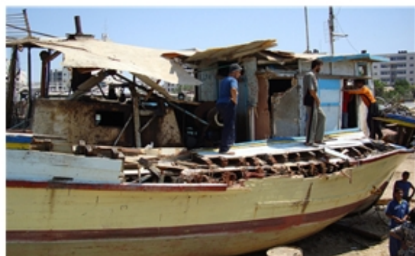
Pictured: Boat of Gazan fisherman after being rammed by an Israeli gunship while fishing off the coast of Gaza City.

http://www.adalah.org/newsletter/eng/may09/8.php