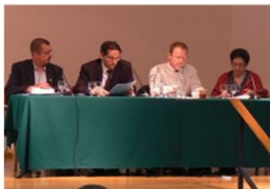
Pictured: At the London launch of the report in 5/09.

The Executive Summary and the Full Report: http://www.hsrc.ac.za/Media_Release-378.phtml