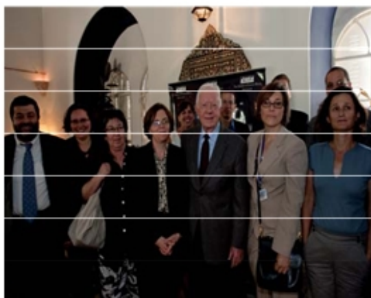
Pictured: Human rights leaders meet with former US President Jimmy Carter in Jerusalem in 6/09.