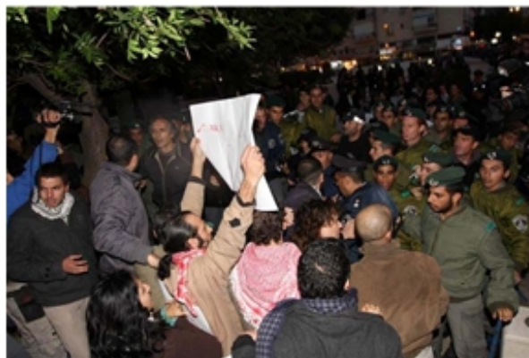
Pictured: Protest against "Operation Cast Lead" in Tel Aviv (1/09).

A letter sent to the IPS and the Minister of Internal Security in 6/09 demanding the immediate closure of the solitary confinement ward in Neve Tirtza, and a criminal investigation into the prison administration and guards responsible for abusing and torturing women prisoners confined in that prison. The letter was sent in Adalah's own name and on behalf of Physicians for Human Rights-Israel, Al-Mezan, and the University of Haifa's Legal Clinic for the Rights and Rehabilitation of Prisoners. The organizations also demanded that the practice of shackling the women to their beds as a form of disciplinary punishment be prohibited. http://www.adalah.org/eng/pressreleases/pr.php?file=09_06_29_9