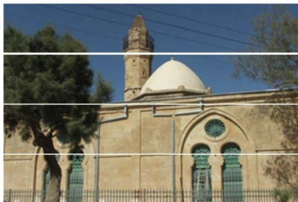
Pictured: The Big Mosque in Beer al-Sabe (6/09)

http://www.adalah.org/eng/pressreleases/pr.php?file=09_06_18_9