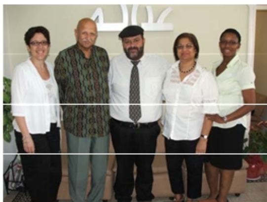
Pictured: Meeting with the South African Ambassador to Israel at Adalah in 6/09.