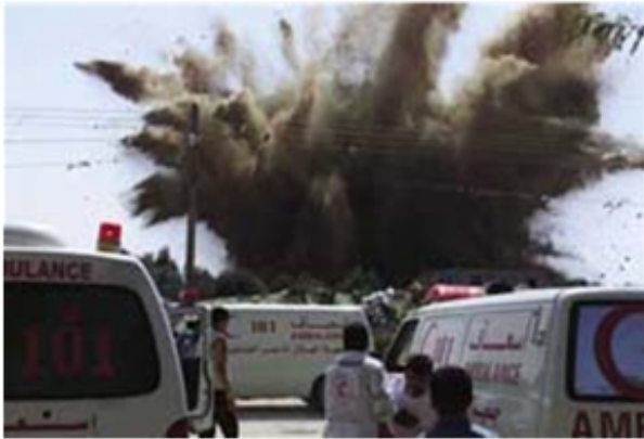
Pictured: Ambulances under attack in Gaza during the course of "Operation Cast Lead" (1/09)

Two urgent petitions submitted jointly by HR NGOs based in Israel to the Supreme Court arguing IHL and IHRL violations: the first, filed by Adalah on 4.1.09, challenging the Israeli military's firing at medical personnel and ambulances , and preventing the evacuation of the injured and the dead; and the second, filed by Gisha on 7.1.09, demanding that Israel ensure the supply of fuel and the repair of the electricity grid . The electricity supply was cut off from about one million Gaza residents, hospitals, and vital systems; around 800,000 people had no water and raw sewage was flowing through the streets. The court rejected the petitions on 19.1.09 (after the end of the fighting) ruling that, "We must hope that the humanitarian array of measures [set up by the state] will operate as required and in accordance with its obligations" (paras. 23, 27). The court's decision indicates that it did not give serious consideration to its role of providing an effective legal remedy to victims.