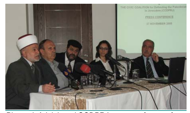
Pictured: Adalah and CCDPRJ press conference for Jerusalem Regional Master Plan

http://www.adalah.org/eng/pressreleases/pr.php?file=08_11_27