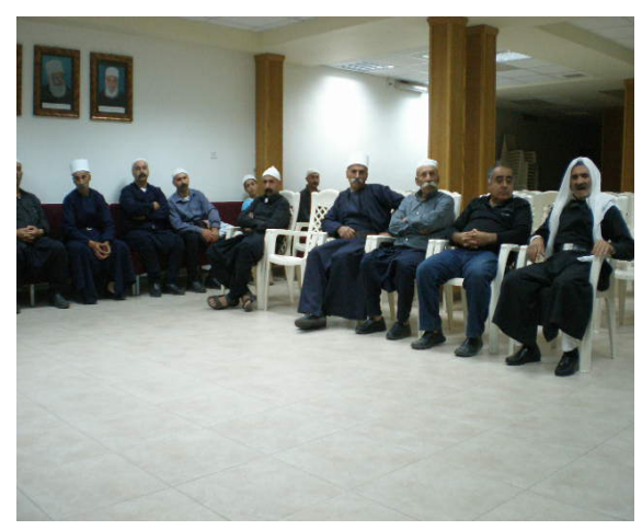
Pictured: Residents of Daliyat al-Carmel who signed affidavits which were included in Adalah's petition.

http://www.adalah.org/eng/pressreleases/pr.php?file=08_01_14