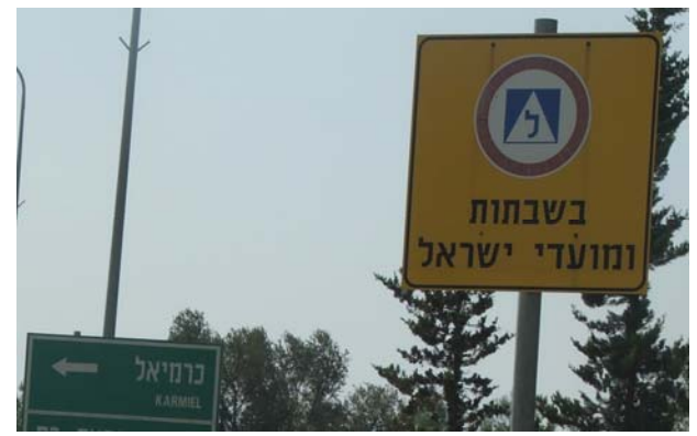
Road sign outside Carmiel banning entry of driving instructors' cars on Saturdays and Jewish holidays

http://www.adalah.org/eng/pressreleases/pr.php?file=09_1_04