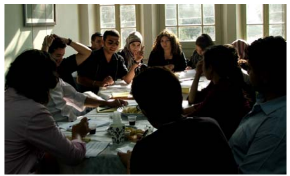
Pictured: Al Quds University law students, Harvard Law School students and Adalah attorneys meeting on the Eastern Ring Road case at Adalah

Adalah staff contributed to the Al Quds University's Human Rights Clinic by giving lectures to the students on Israeli law and Supreme Court jurisprudence, participating in conferences and undertaking joint advocacy projects on the Eastern Ring Road case.