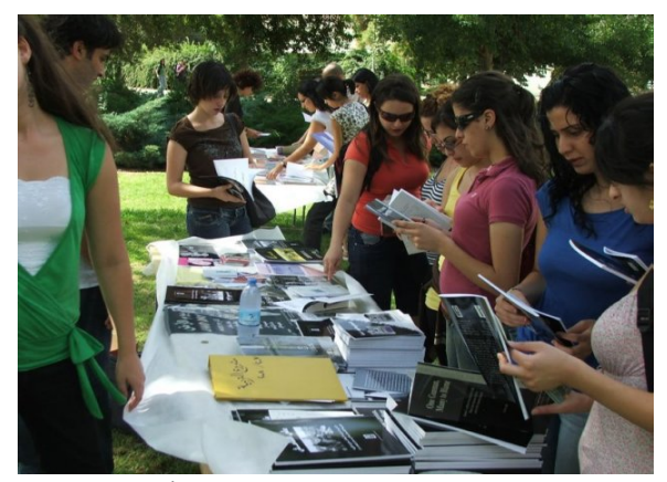
Adalah's 3<sup>rd</sup> annual law students' conference