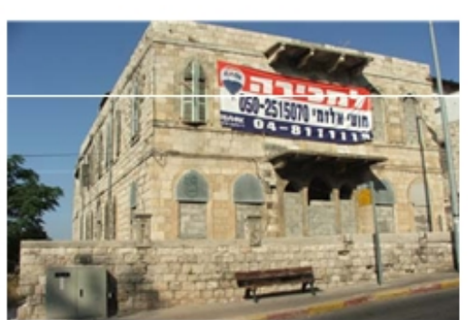
Pictured: Palestinian refugee property in Haifa on sale to the private market, 6/09

In 5/09 Adalah sent a letter to the AG demanding the cancellation of these tenders, arguing that, "Selling these properties constitutes the final expropriation of the right to property of Palestinian refugees, despite the special legal, historical and political status of these properties, in violation of Israeli and international law." The AG responded in 8/09 that the sale were in accordance with a 2006 amendment to the ILA Law, which permits the DA and the ILA to sell a total of 200,000 dunams of "state land." The newly-legislated ILA Law (see above) increased the amount of "state land" offered in public bids to 800,000 dunams.