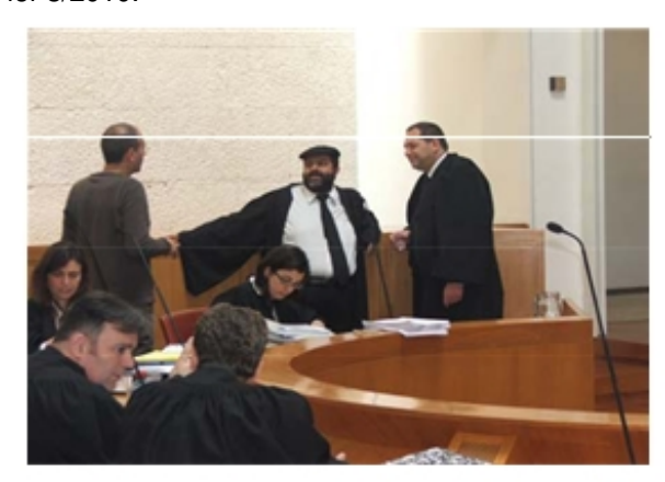
Pictured: Adalah at the Israeli Supreme Court before the hearing on the Citizenship Law case in 3/09

reviewing the case to 11 judges, and set a hearing for 3/2010.