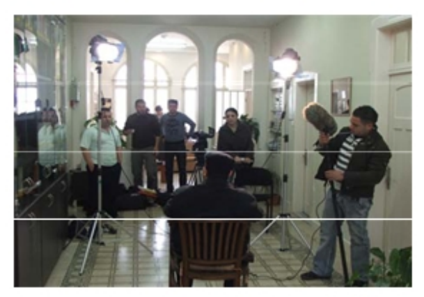
Pictured: Al Jazeera filming Adalah's General Director for a documentary on the ban on family unification, 2009

Adalah's work appeared in the Hebrew language press and websites in Israel such as Haaretz, Ynet, Walla, Ma'ariv and Hebrew radio Reshet Bet and Galatz Sahel. Some TV coverage was obtained for major cases. In general, however, the Hebrew media remains hostile to Arab citizens. 2009 also marked a decrease in Hebrew coverage due to significant financial cuts at the dailies.