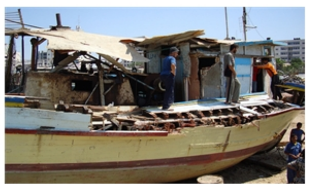
Pictured: Boat of Gazan fisherman after being rammed by an Israeli gunship while fishing off the coast of Gaza City

increase the fishing area available from 3 to 20 nautical miles as previously agreed between the PA and Israel. The fishing industries provide the basic necessities of life for around 35,000 people in Gaza. In recent months, the navy has escalated its harassment of and assaults on the fishermen.