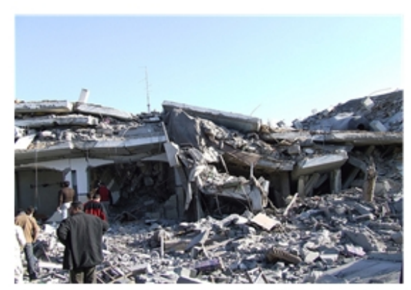
Pictured: Gaza City home entirely destroyed during "Operation Cast Lead" (1/09)

actions in a short paper that was issued in our newsletter on the First Anniversary of the War on Gaza in 12/09.