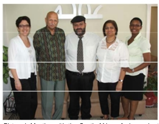
Pictured: Meeting with the South African Ambassador to Israel at Adalah in 6/09.

Adalah hosted the new South African Ambassador to Israel, Ismail Coovadia , at our office in 6/09.