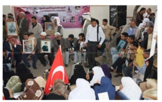
Families of Palestinian prisoners incarcerated in Israeli jails protest at the ICRC in Gaza, 4/09

See coverage in the UPI: "Court upholds ban on Gaza prisoner visits"