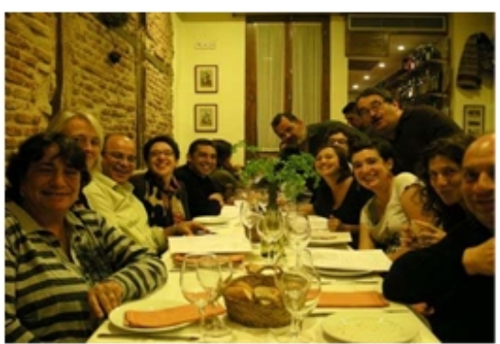
Pictured: The EMHRN Working Group on Palestine/ Israel and the Palestinians.Madrid.10/09.

Adalah's International Advocacy Director participated in this two-day seminar held in Cairo in 5/09. The seminar brought together more than 100 NGO representatives from around the region for a consultation on the EU's financing of thematic programs. Participation supported by the EU.