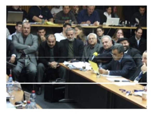
Pictured: Arab MKs and Adalah's General Director at the Central Elections Committee in 1/09

In the run-up to the elections, right-wing Members of Knesset (MKs) submitted motions to the Central Elections Committee (CEC) in 1/09 to disqualify two Arab political parties - The National Democratic Assembly (NDA)-Balad and the United Arab List-Arab Movement for Change (UAL-AMC) - from running for election. The motions charged violations of section 7A of the Basic Law-The Knesset: that the NDA denies the existence of Israel as a Jewish and democratic state by calling for a "state for all its citizens," and that both the NDA and the UAL-AMC support terror organizations and 'enemy states' against Israel. Adalah represented the parties before the CEC arguing that there is no legal basis to disqualify either. The CEC voted to ban to the Arab parties, supported by the three main political parties, Kadima, the Likud and Labor.