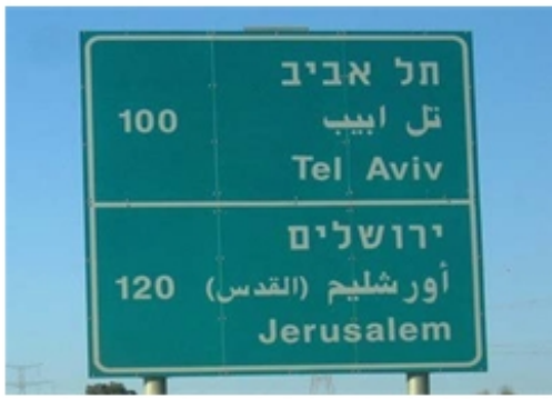
Pictured: Road sign featuring the Hebrew word for Jerusalem (Yerushalayim) in Arabic

An urgent letter sent in 7/09 to the AG demanding the cancellation of a decision by the Transport Minister to Hebraicize all road signs in Israel, by replacing all road signs in the state with new signs that show the Hebrew names of places in Arabic letters, regardless of the common and historical Arabic name of the place. The state argued that the Transport Minister's decision was not final, and that a committee had been appointed to investigate the issue.