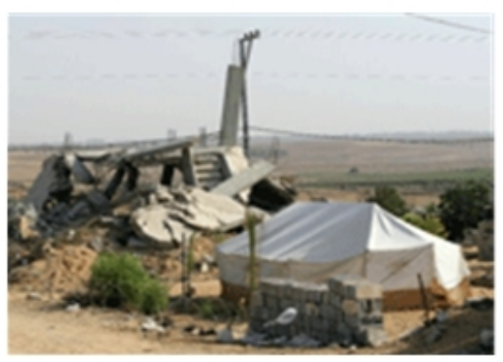
Family living in a tent beside their demolished home in Gaza. Photographer: Aida Alibegovic, Fall 2009

Immediately following Israel's military assault on Gaza from 27/12/08-18/01/09, a main focus of Adalah's international advocacy work was to seek accountability for the thousands of direct victims. A key aspect of this work was our cooperation with the UN Fact-Finding Mission on the Gaza Conflict ("The Goldstone Mission"), established by the UN Human Rights Council in 4/09 to investigate the events. The Goldstone Mission report, issued in 9/09, is a watershed; it sets out clear factual and legal findings and implementation mechanisms, and constitutes a significant step towards obtaining redress for the victims. Adalah subsequently pressed for states' endorsement of the Mission's recommendations in the UN Human Rights Council and the UN General Assembly.