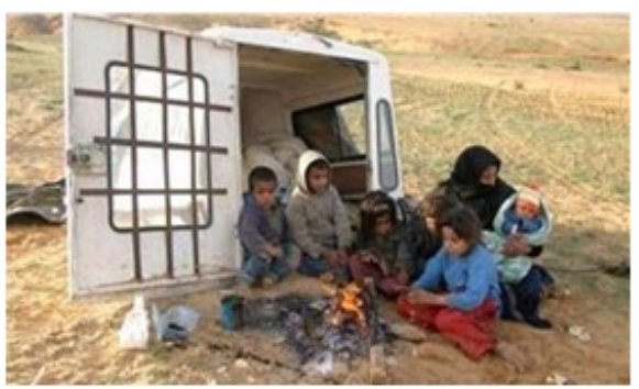
Pictured: An Arab Bedouin family in the Naqab A pre-petition submitted to the AG in 11/09 on behalf of residents of the unrecognized Arab Bedouin village of Tel Arad and PHR-Israel demanding that the MOH establish a health clinic in the village. There is currently no clinic to provide medical services for the village's 2,000 residents.

A Supreme Court petition filed in 12/09 demanding the cancellation of a decision by the MOH to close down "mother and child" clinics that provide essential obstetric services in three Arab Bedouin villages in the Naqab. Adalah submitted the petition on behalf of 11 women, local council heads, and NGOs Yasmin, PHR-I and the Galilee Society. The three clinics are among six established following a petition on access to health care for women and child in the Naqab submitted by Adalah in 1997. Update: In 1/10 the MOH admitted the situation was appalling but claimed a lack of nurses and doctors willing to work in the Bedouin villages.