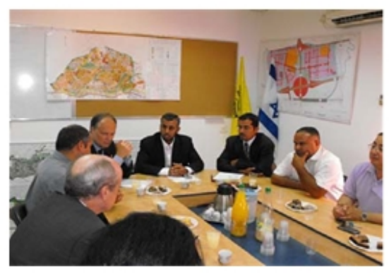
Pictured: NGO leaders and the mayor of Rahat Municipality meet the US Ambassador in 6/09.

Adalah regularly sent out information and updates to embassies and consulates in Israel and the OPT concerning our legal actions and reports, and held numerous meetings with country representatives on request.