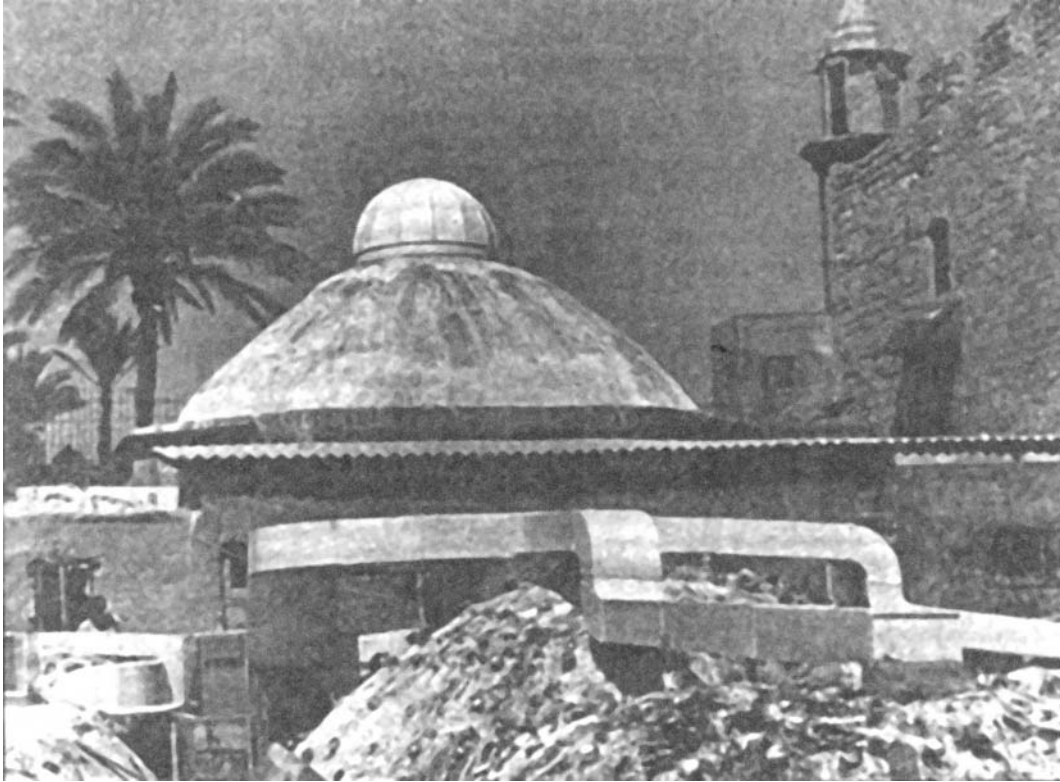
The minaret of the Al-Dabagh Mosque prior to its demolition in the early 1980s