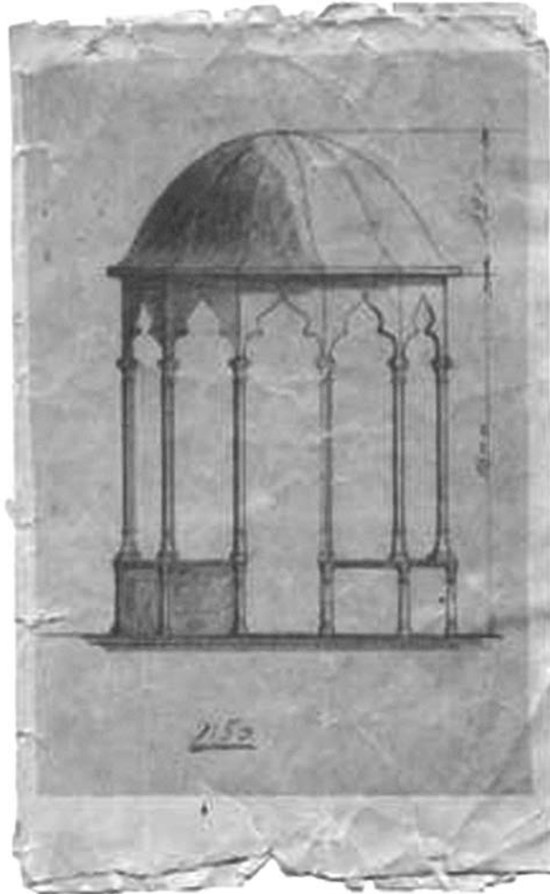
Sketch of the Souq Sabil