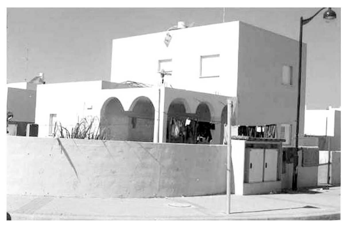
3. The Neve-Shalom neighborhood: a sheig construction at the front of a house