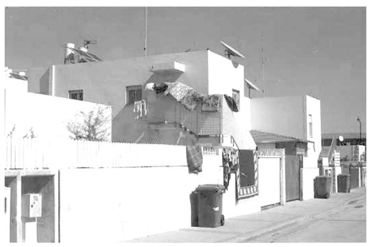
4. The Neve-Shalom neighborhood: additions attached to the fences and stairs of houses