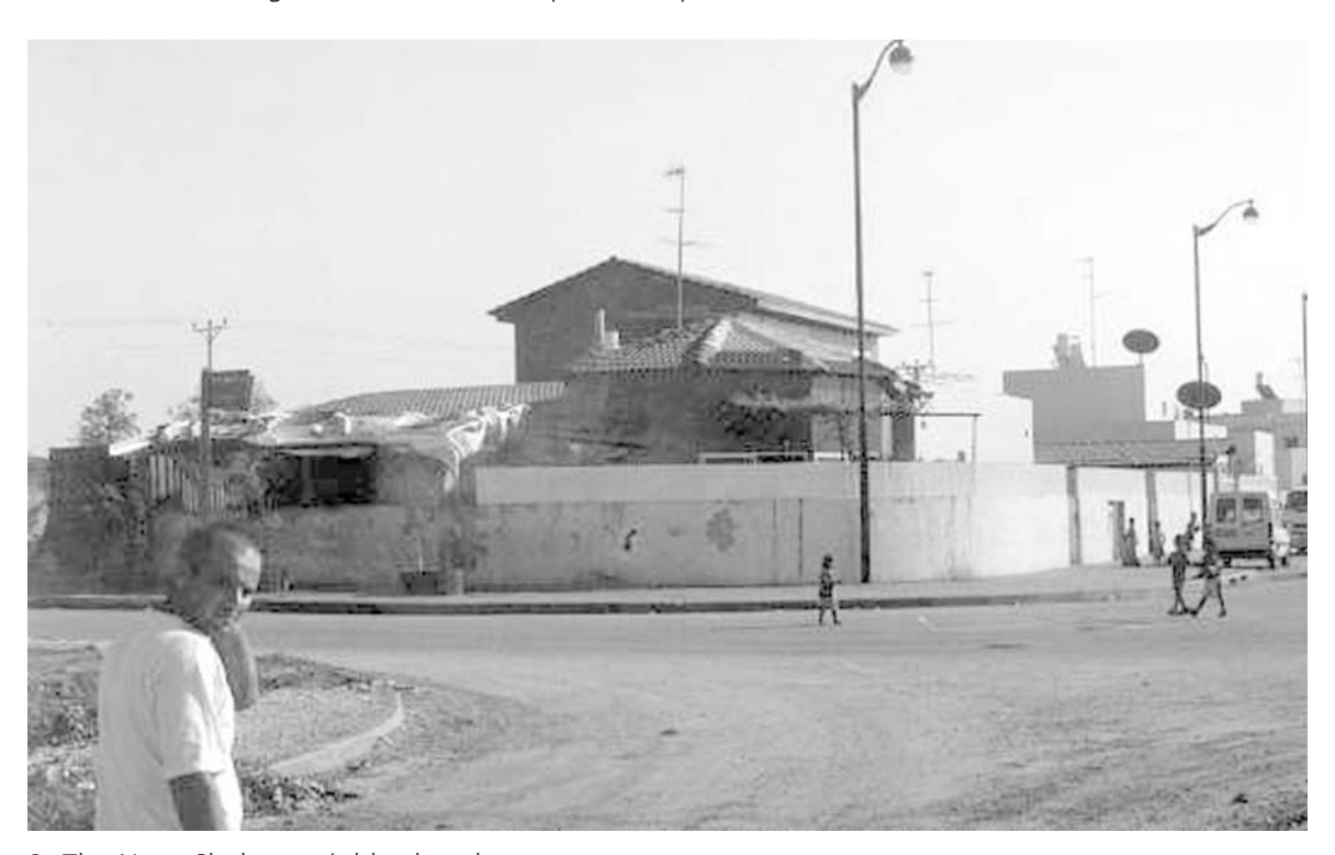
2. The Neve-Shalom neighborhood: a store