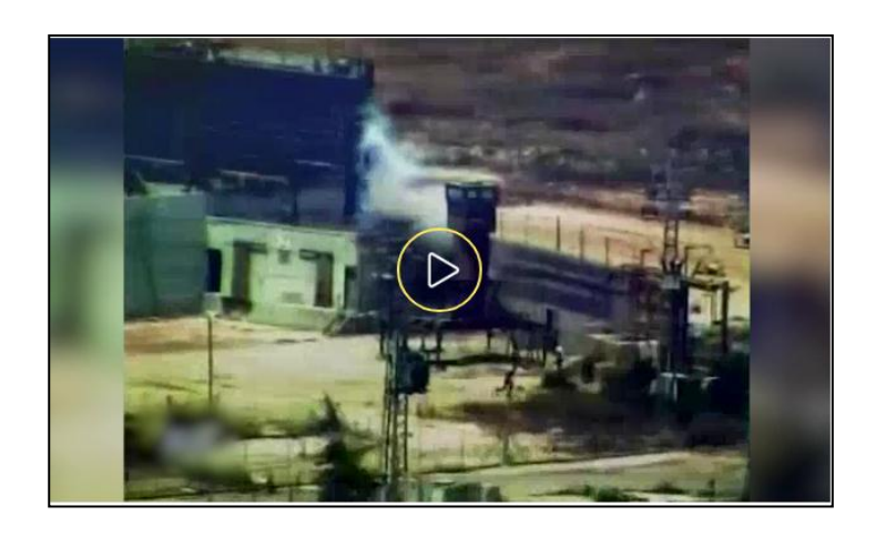
Explosive device explodes on an IDF observation post at the border.

The use of incendiary and explosive kites and balloons also poses a direct threat to the lives of IDF forces, as well as to military infrastructure in the vicinity.