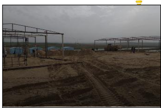
Hamas engineering activities setting up the focal sites.