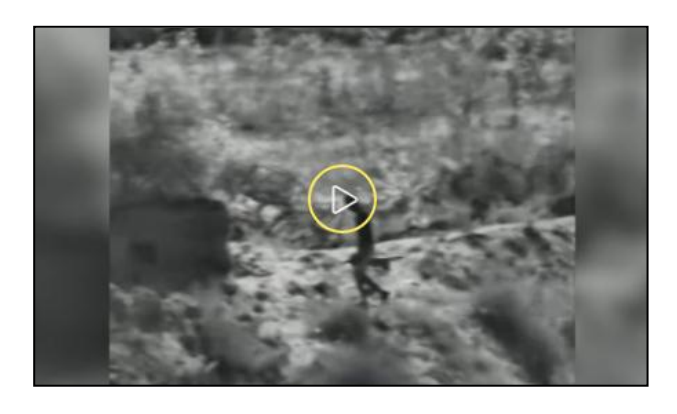
In this video, a person can be seen concealing an anti-tank missile in the area of border riots, prior to the mass events, near Khan Younis.