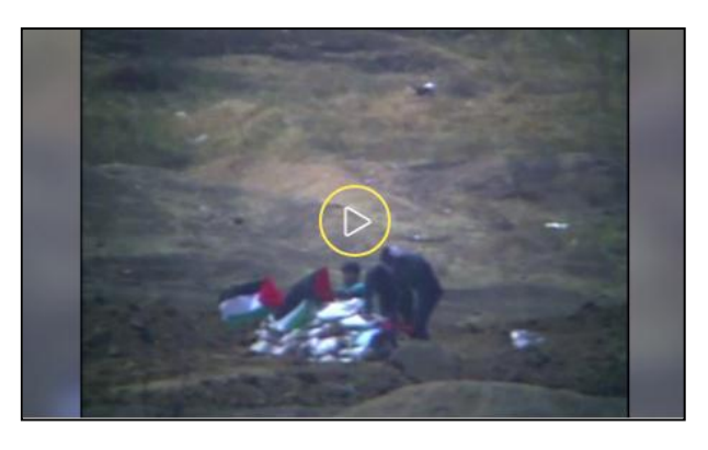
In this video, people can be seen preparing sandbags in the Gaza border area, to be used to conceal presence and activities during the riots."

As noted above, large numbers of Hamas operatives, including specially trained operatives, were present during these events, and played active and leading roles in inciting the masses, sabotaging the security infrastructure and carrying out attacks. Hamas operatives also worked to gather intelligence on IDF positions prior to mass events and to prepare the area so as to further facilitate the achievement of Hamas's aims (see below). Hamas operatives have also launched incendiary and explosive balloons from within the riots and from nearby Hamas posts.