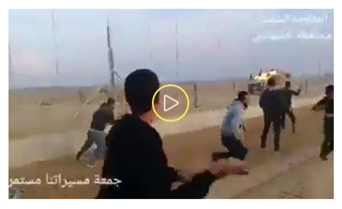
Video via: <u>Facebook</u> | An explosive device thrown at an IDF jeep on the other side of the border.

Booby-trapped explosive devices and mines are also laid along the fenceline under the cover of the violent riots with delayed detonation devices. These attacks pose a direct threat to the lives and safety of IDF forces operating in the border area.