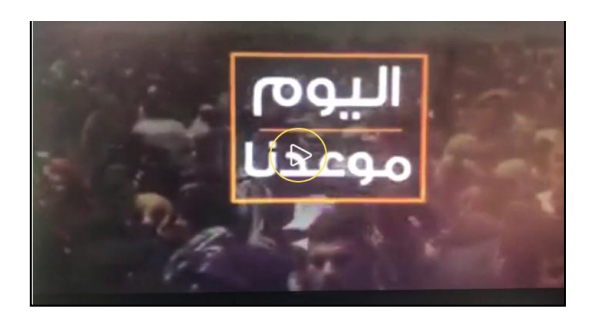
This is a video aired on Hamas-run television in Gaza, calling on the population to continue the struggle until victory, and calling them to join the events on the upcoming Friday at the border.

Hamas also undertook a program of incitement and coercion though the local media, television channels and newspapers, calling on the population to attend the events. This program has continued unabated until today. Hamas also contracted bus companies to provide transport services from population centers in Gaza to the focal sites.