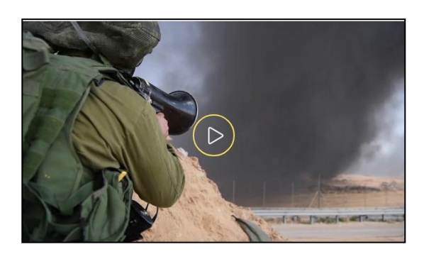
IDF forces employ megaphones and other means to provide verbal warnings to rioters.

canisters will land is reduced, sometimes resulting in unintended harm to persons present in the area.