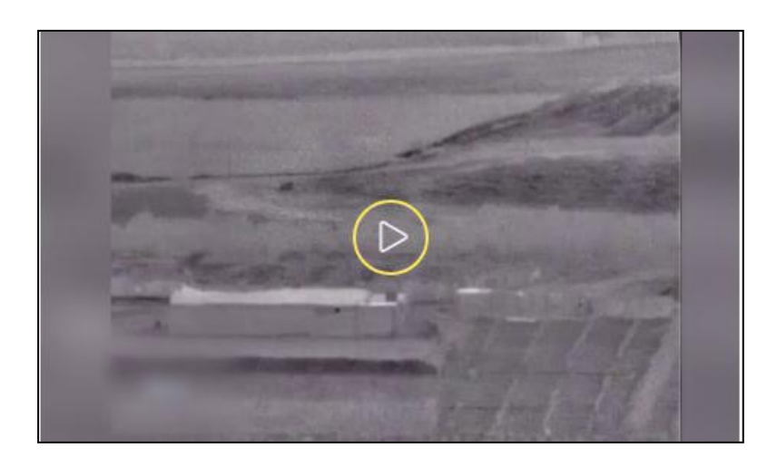
In this video, an incendiary balloon is launched from one of the focal sites managed by Hamas

As noted above, large numbers of Hamas operatives, including specially trained operatives, were present during these events, and played active and leading roles in inciting the masses, sabotaging the security infrastructure and carrying out attacks. Hamas operatives also worked to gather intelligence on IDF positions prior to mass events and to prepare the area so as to further facilitate the achievement of Hamas's aims (see below). Hamas operatives have also launched incendiary and explosive balloons from within the riots and from nearby Hamas posts.