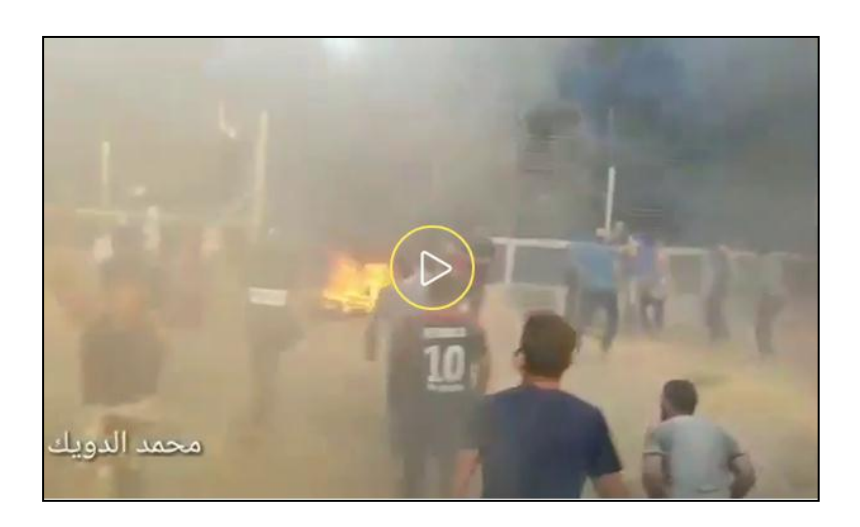
In this video, posted on Palestinian social media, explosions on the security infrastructure can be seen, causing serious damage, as well as sabotage of the technology that the infrastructure contains.

The substantial damage to the security infrastructure has resulted in heightened risk to the communities living in the vicinity of the Gaza Strip and to Israel more generally. Damage to the technology and physical elements of this infrastructure leaves entire sectors of the fence inoperable, thus impairing the IDF's ability to detect and respond quickly to attempted infiltrations into Israel. Damage to engineering equipment in the area has resulted in delays in completing the underground obstacle and technology designed to detect cross-border tunnels.