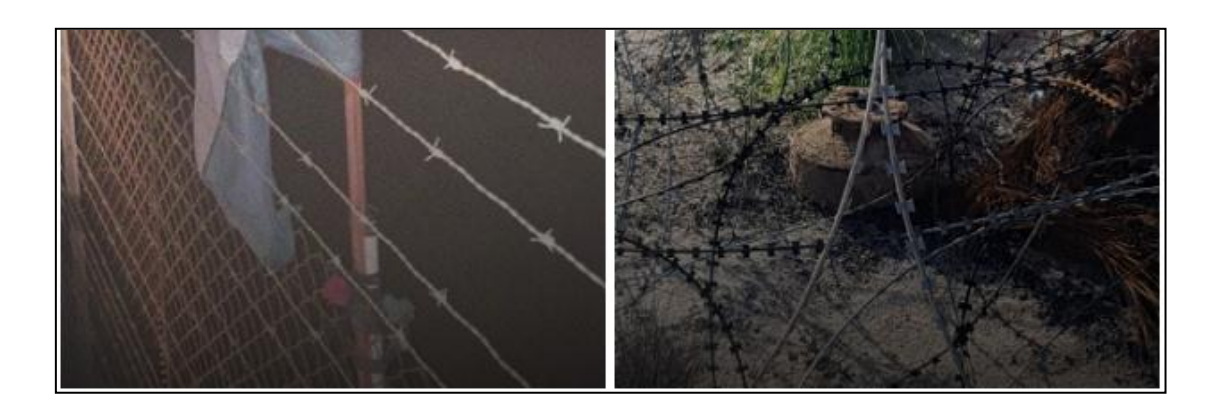
A booby-trapped flag placed on the security infrastructure during a riot, and a mine concealed in the ground near the security infrastructure during a riot.

At the same time, kites bearing incendiary and explosive materials have been launched both from within the riots and elsewhere against IDF forces and military infrastructure in the Gaza border area, taking advantage of the general wind conditions in the area which blow from Gaza towards Israel, and which are particularly strong in the afternoon. These means are used to cause harm to IDF forces in exposed positions on the border, to damage and destroy military infrastructure such as surveillance posts, and to divert IDF resources from defending the border to contending with the outbreak of fires behind their positions.