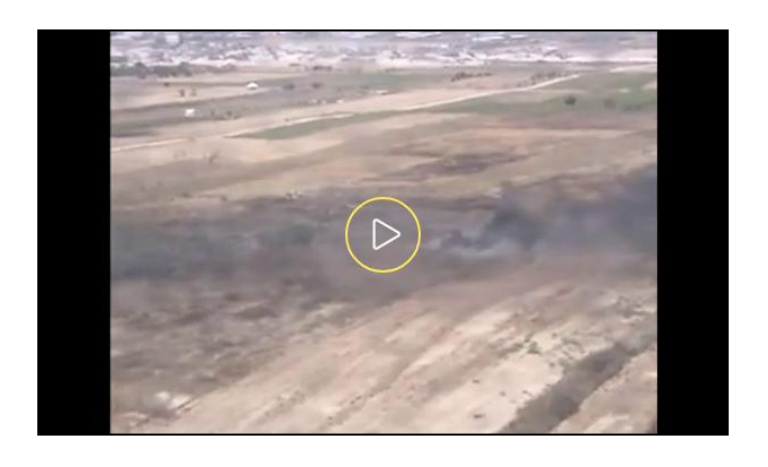
Tear gas is limited in its effectiveness for a number of reasons, including the open areas resulting in dispersal, and the wind direction.