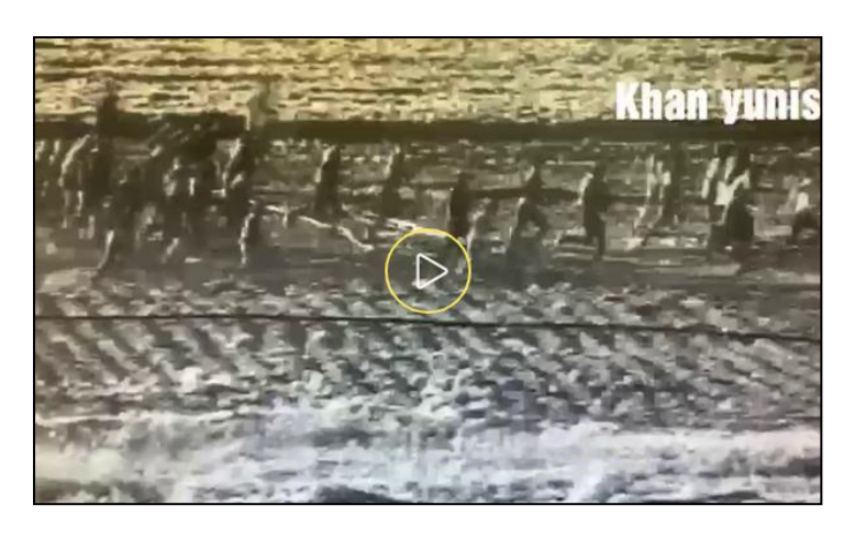
This video demonstrates a group moving quickly northwards along the border.

Fifth, Hamas has increasingly been directing groups to conduct violent riots and attacks at different points along the border, in order to exploit the fact that IDF forces coming to those sites do not have pre-prepared defensive positions at such points. The incident in which an IDF officer was shot in the head in January 2019 (the bullet piercing his helmet), occurred during a violent riot taking place in an area which had not been the site of violent riots previously and where the construction of IDF positions had not been completed.