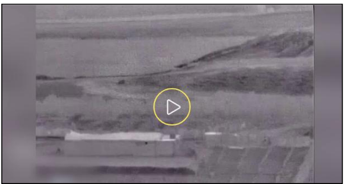
A kite launched by Hamas operatives next to a Hamas military position at the northern border.

Drones used by the IDF to deliver teargas have been felled both using electronic jamming as well as by shooting them down from the sky.