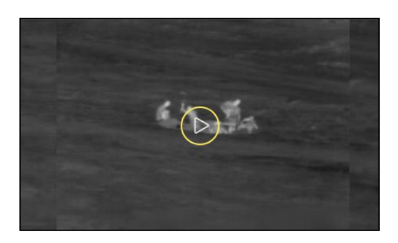
In this video, a group can be seen digging a position in the Gaza border area under the cover of darkness, to be used to conceal presence and activities during the riots.

Hamas also purchased and distributed tools for sabotaging the security infrastructure, such as large quantities of wire cutters, and provided military grade grenades as well as tools and elements for creating explosives for use in the border area. Hamas operatives are also responsible for preparing the areas of the riots beforehand, digging defensive positions and deploying protective items such as drum barrels.