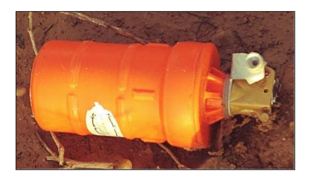
An example of the type of grenade thrown at IDF forces and at the security infrastructure during the events."