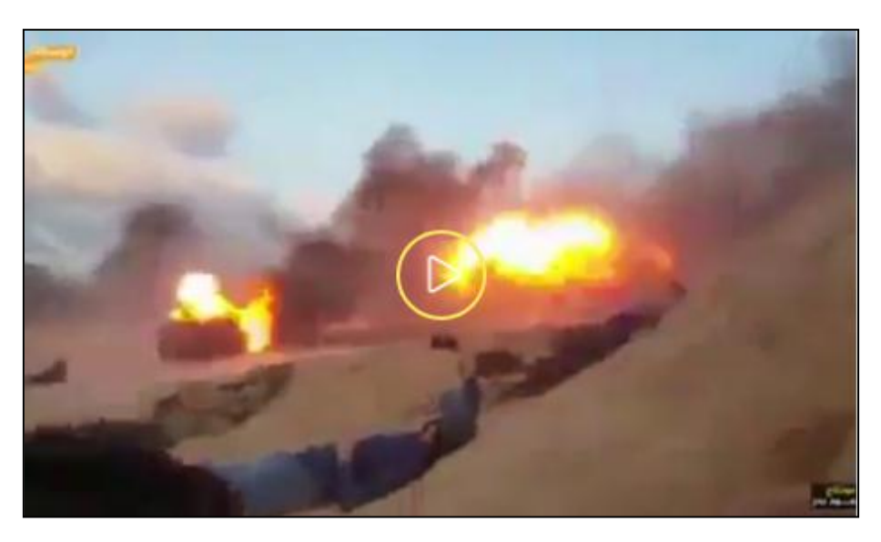
In this video, examples of the violence involved in the riots can be seen, including destroying the detection technology on the security infrastructure and explosions blowing up sections of the security infrastructure.