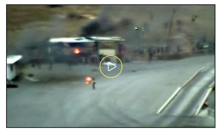
Damage caused to a crossing during one of the violent riots.

The violent riots and attacks have also resulted in significant damage to the crossing points between Israel and the Gaza Strip. Violent riots in the Kerem Shalom and Erez crossings have resulted in the closure of these crossings for repairs, as has mortar fire which directly landed in the Erez crossing.