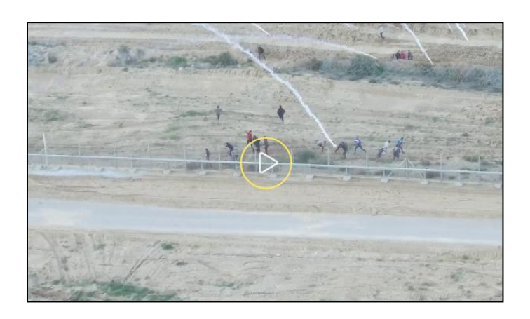
This video shows how IDF forces may use non-lethal means even when groups are at the fenceline, and the limited effectiveness of such means in keeping people away from the security infrastructure.

In many cases, IDF commanders have refrained from using potentially lethal force even when individuals and crowds have been at the fenceline, sabotaging the security infrastructure, and even launching explosives and other projectiles towards IDF forces.