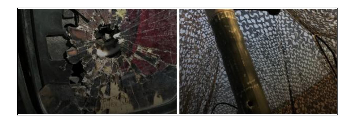
Bullet holes in IDF positions and vehicles at the border.