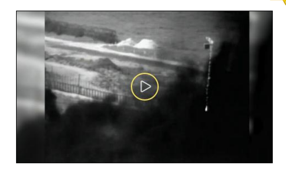
An incendiary kite aimed towards IDF forces stationed at the border.

This was then augmented by the use of incendiary and explosive balloons, which have threatened the lives of Israelis within their range and created widespread harm and damage inside Israel.