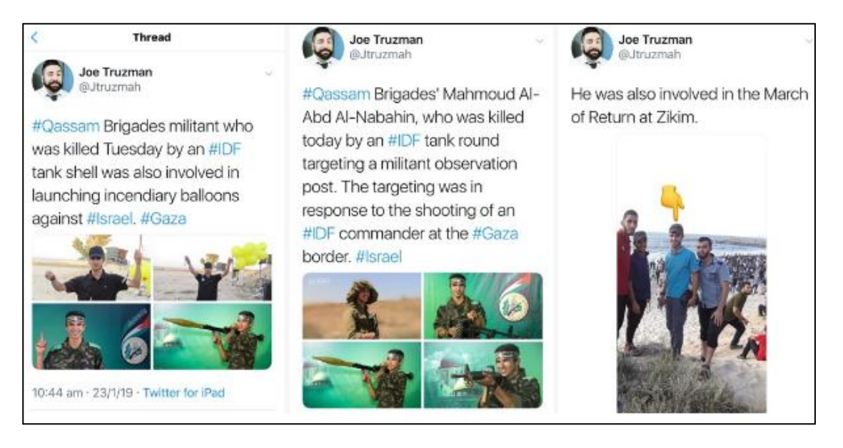
In response to shooting attacks on the IDF while contending with violent riots on the border in January 2019, including one incident in which an IDF officer was wounded, the IDF targeted a Hamas military position in the border area, killing a Hamas operative. This operative was involved in different activities in the Gaza border events.

Hamas has undertaken such practices in the past, deliberately concealing military objectives within civilian sites and disguising operatives as civilians so as to avoid attack and exploit any resulting civilian harm to generate criticism of Israel (see Chapter IV here). In the most recent largescale hostilities in Gaza, in 2014, Hamas's Interior Ministry called on the Gaza population to avoid identifying militants in the media, and to declare that anyone killed in the conflict was a civilian (see the Annex here). Here, too, in the context of the Gaza border events, Hamas called on people to conceal their identities and wear civilian disguises, assumedly so that Hamas operatives could not be identified by the IDF either before or after the events.